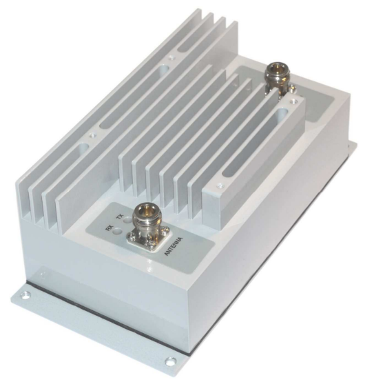
Dimensions 78 x 108 x 220 mm

TULS - MQ, compatible with IEEE 802.11a OFDM radios as well as others